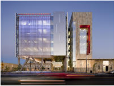
View of office tower from west

Chandler City Hall is a low- to mid-rise government complex developed on two city blocks and located with Arizona Avenue along its eastern edge and Washington Street as its western edge in downtown Chandler. The center of the development is bisected by Chicago Street. The north block is devoted to a 5-story office tower at the north end and one-story buildings along Arizona Ave and Washington Street. The tower houses City departments while the 1-story buildings contain an art gallery, council chambers and a television studio. The south block is devoted to one-story buildings and a 2-level parking structure. The buildings contain a neighborhood redevelopment office and a print center.