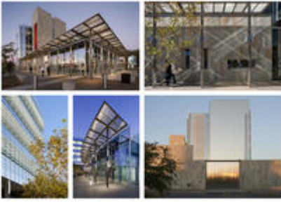
Collage of material images - Photo Credit: Bill Timmerman

The overall design and material selection embody both a reflection of the progressive nature of this knowledge community and a timelessness that respects the past. The single-story buildings are a modern interpretation of the regional historic vernacular that emphasized mass, punched window openings and shaded walkways. Stone was used to emphasize mass and be representative of a civic center aesthetic. Metal and glass were predominately used throughout the complex to express to the community, "We are about the future, and one of openness and transparency."