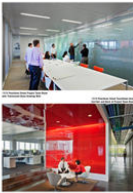
Project Team Room and Touchdown Space - Photo Credit: Eduard Hueber

The common corridor and core are separated from the open office area by the structure that holds the team rooms and the touchdown space. More than 60% of this structure is entirely demountable and designed to be deconstructed and repurposed. The team rooms complete the flexible workplace strategy designed for the collaborative and interdisciplinary practice. These areas serve as the “project memory” and provide an ongoing place for project teams to collaborate and develop ideas, hold critiques and meet with team members. The space is highly customizable with movable dividing partitions, multi-function display walls and flexible team furniture. The translucent back wall provides lighting for the common corridor (thereby eliminating all corridor lighting) while providing display and whiteboard capability for the teams. In the open office area, modular workstations, modular carpet on raised flooring and demountable partitions are all designed to be easily deconstructed.