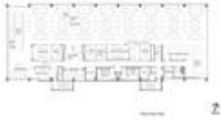
Plans 1, 3