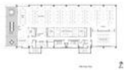
Plans 4-5 - Photo Credit: Perkins+Will