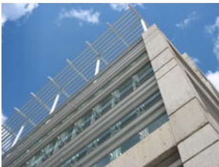
1315 Peachtree Street West Facade Shading

The best opportunity for positive environmental impact was to select an existing building, retain as much of the structure as possible and upgrade and optimize systems such as exterior glazing, HVAC, lighting and water. In order to reduce the amount of demolition and construction waste sent to the local landfills, the team set a target that 75% of waste generated would be reused, repurposed, recycled or otherwise diverted. The owner commits at least 1% of their firm-wide hours pro bono to organizations needing design services. By reaching out to many of these organizations, needs for furniture and materials were matched with salvaged items from the building's previous build-out. As a result, 80% (120,000 pounds) of demolition and construction waste was diverted from landfills or recycling yards to more than 20 local nonprofit organizations.