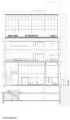
Section Looking East - Photo Credit: Perkins+Will