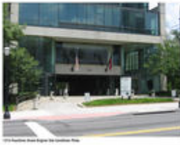
1315 Peachtree Street Existing Conditions - Photo Credit: Perkins+Will