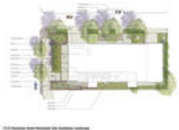
1315 Peachtree Street Redesigned Site - Photo Credit: Perkins+Will

With 500,000 residents in its 85,000-acre footprint, Atlanta's density is 1/15 that of Paris. The city has begun to focus on increasing density within its city limits by providing more housing, amenities and public transit, thereby reducing dependence on single-occupancy automobiles. The pedestrian-oriented Arts District is easily accessible from in-town neighborhoods and the Arts Center Transit Station. With their previous office only a block away, the owner was committed to remaining in Midtown Atlanta and supporting development of this urban core.