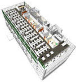
3rd Floor Plan Perspective (Typical) - Photo Credit: Perkins+Will