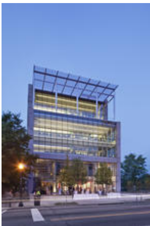
1315 Peachtree Street Exterior - Photo Credit: Eduard Hueber