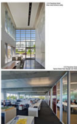
1315 PEachtree Street Daylighting and Views