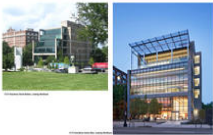
1315 Peachtree Street Before and After - Photo Credit: Perkins+Will

Located in the heart of Midtown Atlanta, the original project was designed with two curb-cuts on Peachtree Street and a semi-circular drive leading to a street-level parking garage. This was hazardous to pedestrians and an underuse of valuable street-level real estate. The design team removed the curb-cuts, creating a permeable civic plaza and eliminating 1/3 of the building’s parking.