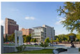
Exterior Elevation Photos