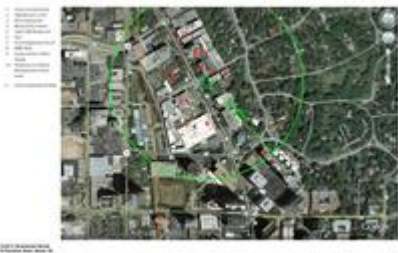
Context Plan