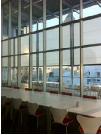
1315 Peachtree Street 5th Floor with Exterior Shading