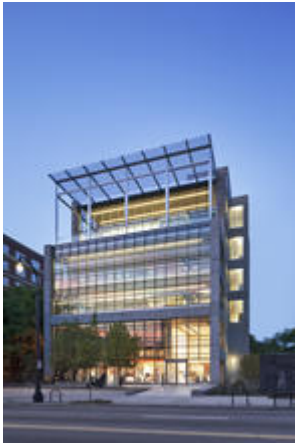
1315 Peachtree Street Exterior - Photo Credit: Eduard Hueber

1315 Peachtree Street is a civic-focused, adaptive reuse of a 1986 office structure transformed into a “living laboratory” and educational tool for sustainable design. The client for the project in Midtown Atlanta is a multidisciplinary design firm committed to design excellence and sustainability in both work and practice. Their new home had to reflect these values by meeting the highest levels of sustainability, allowing their designers to work in an interdisciplinary and integrated manner fostering creative and inspiring design and serving as an ongoing learning opportunity.