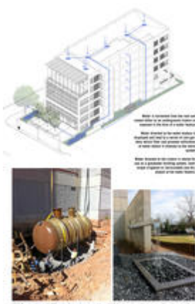
1315 Peachtree Street Water Reduction Strategy

As a result of the dramatic 2007-8 drought, availability of water has become a major issue for