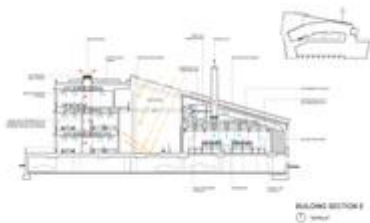
Building section with overlay of air system and sun angles.

The deliberate inclusion of large windows in both wings, even in the laboratories, also meant compensating for glare at certain times of the day. The set of deep eaves on the southern exposure minimizes the hours of direct sunlight into the laboratories, while still admitting ample daylight onto the benches even on cloudy days. Two arrays comprising 26,124 SF of photovoltaic surface serve as both an energy source and a shade structure, leveraging the resource and mitigating the challenge of sunny Southern California days. The PV array was configured to provide shading of the western patio area, while the PV panel over the interior courtyard provides a diffused light into the space and allows reflective light off the concrete walls to 'bounce' light into the northern benches of the laboratories. It is predicted that the arrays will exceed the building demand, pushing excess power generated back into the grid. Spanish cedar, often used to build boats, was used in the exterior wood wall system. Not only will this wood stand up to the seaside climate, but it will age naturally, without the use of harsh chemicals.