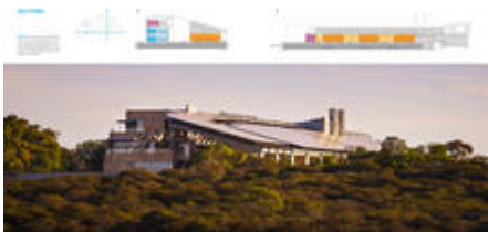
Additional building sections - Photo Credit: © Nick Merrick