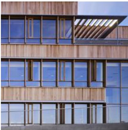
Operable windows shown from exterior.

Regardless of one's location in the building, each occupant can maintain a connection to nature via unobstructed views outdoors through large windows. Even the garage has openings that allow for its natural ventilation, while providing views out to the landscaped grounds and natural surroundings. Office occupants have views north or to the courtyard. Laboratory occupants have views south and also into the courtyard. The windows that look into the courtyard, also provide connections among occupants. The use of overhangs and shading devices, in combination with automatic and manual shades that mitigate glare issues, provide day-lit spaces, even on a cloudy day, such that 80-90% of the occupants rely solely on daylight during daylight hours. Occupant control features include over-ride of the automatic shades, light-level control down to an office level, and operable windows in all office areas. Conditioning only the ventilation air required for the space, allowed for the use of a 100% OSA system for the offices. Internal and external loads are mitigated via hydronic heating and cooling, primarily via induction beams—chilled beams that have cooling and heating capabilities.