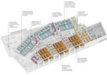
Axon of interior spaces shows how sustainability features were applied.