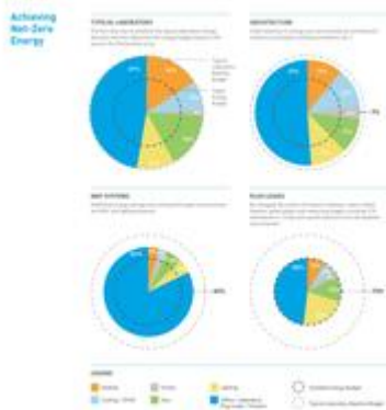
Energy diagrams.