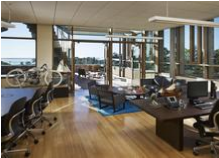
Executive office shows interior finishes against a backdrop of sea and Ecological Reserve vistas.