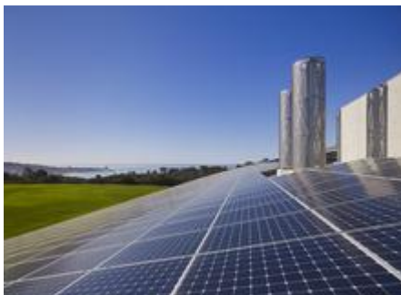
Photovoltaic panels help power the building.

The project's NZE approach led to several integrate strategies. First, unlike buildings that use electricity for cooling, then reject building heat into the atmosphere, and burn gas at night for heat generation, this project utilizes a 50,000-gallon Thermal Energy Storage (TES) system as the primary conditioning driver. Cooling towers cool the TES at night; allowing the building to be conditioned most days without electrical chillers. As cooling is drawn out of the TES, it's replaced with warm water that can be used at night for heating purposes. Additionally, reject heating is captured from a separate water loop feeding a water-cooled, low temperature (-80F) freezer farm, and an exhaust air heat recovery from the laboratory exhaust air. This is one of the few buildings, and the only laboratory in California, that does NOT have a natural gas line extended to it, meaning no on-site burning of fossil fuels is taking place to generate heat or for other uses, except for the diesel fire generator, used for life safety and minimal stand-by power for laboratory equipment. Furthermore, a large photovoltaic array is sized to over-produce most of the year, pushing energy into the grid and putting the NZE goal within reach.