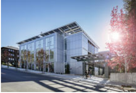
North elevation from Ridge Road