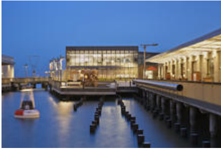
Dusk view of Bay Observatory