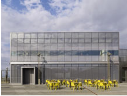
The new Bay Observatory