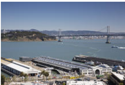
Aerial view looking East showing 1.3 MW PV Array