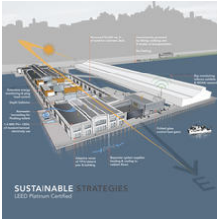
Sustainability strategies Diagram

The mechanical system draws bay water into a titanium heat exchanger/heat pump serving the radiant heating/cooling system. The bay water pipes require pigging to clear marine organisms growing inside and are now a favorite exhibit. The building uses 55% less energy than a comparable benchmark building, without fossil fuels except for cooking. The finite roof area with SunPower PVs provided a maximum energy budget, and required large exhibit/plug loads be addressed. A detailed study led to redesign of some exhibits to improve efficiency, and programmable circuit breakers automatically turns off exhibits when the museum is closed. More than 110 power meters monitor electric loads, enabling Exploratorium staff to continuously improve building operation. A live display in the lobby communicates this living NZE goal to the building's more than half million visitors, as well as the 12 million visitors online. In year one, the building did not reach its NZE goal, but a number of improvements have been made in design and operation that will improve performance in year two.