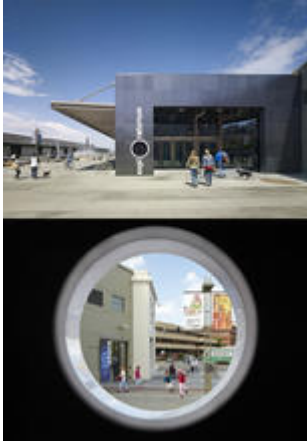
The plaza and museum entrance - Photo Credit: Photo by Bruce Damonte