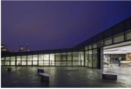
The outdoor Bay