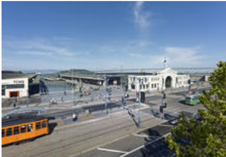
View from the Embarcadero - Photo Credit: Photo by Bruce Damonte