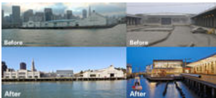
Before and After of Pier 15 & 17 - Photo Credit: Photo by Bruce Damonte

The Exploratorium is an internationally known science museum focused on hands-on exhibits of natural phenomena. They recently moved to this new location, carefully restoring the historic Pier 15 on San Francisco's downtown waterfront. Visitors can now experience 80,000 square feet of science exhibits in the historic structure, with new cafes and event space located in the contrasting modern glazed observatory with unobstructed views of San Francisco Bay. The building also offers a theatre, more than a dozen classrooms, labs, and teacher training rooms, wood and metal workshops, two retail stores, offices, and a large outdoor plaza.