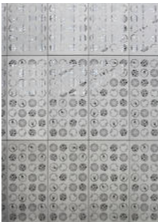
Stainless steel wall panels with magnified cutout images of local photoplankton - Photo Credit: Photo by Bruce Damonte

Rehabilitation of the existing piers marks a significant contribution to the historic legacy of the San Francisco waterfront as well as substantially reducing the construction waste and carbon impacts that building new would have incurred. By working diligently with our structural consultant early on in the project, we were able to coordinate our architectural design intent with the needs of the structural upgrades. This effort allowed us to perform a comprehensive seismic upgrade to the buildings while maintaining most of the existing historic walls, steel trusses, windows and wood ceilings. Approximately 93% of the existing building structure and envelope was refurbished, upgraded, and reused and existing lead and asbestos safely removed. Construction waste management diverted 94% of material from the landfill. On the interior, new walls and mezzanines were carefully planned to fit within the existing grid of historic steel trusses and materials were selected for durability, indoor air quality, and future flexibility. The historic classification of both the exterior and interior of the envelope limited the thermal improvements that could be made but improvements were made where feasible and high-performance glazing was used for new portions of the project.