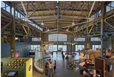
The East Gallery