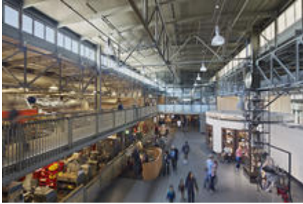
View of the Exhibit Development Shop and the South Gallery

The existing 1931 warehouse was built to take advantage of the local climate by maximizing daylighting and natural ventilation. Like many buildings of its era, the architecture had to do the work of creating light, ventilation, and climate control. Oriented along a northeast to southwest axis, the existing clerestory windows are the primary strategy for bringing daylight into the building while additional openings were strategically added to allow for views and light. The 100% outside air system with no recirculation takes advantage of San Francisco's temperate climate while the heating and cooling system utilizes the proximity of the massive thermal resource of the ocean and the thermal mass of the concrete deck. The bay water seasonally fluctuates between 50°F and 66°F and is used as a heat source and heat sink to efficiently produce hot and chilled water for the building's radiant slab via electric heat pumps. This incredibly low energy strategy also eliminated the need for cooling towers, and thereby solved a major design challenge in this historic structure.