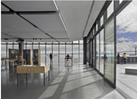
The Bay Observatory has indoor and outdoor space for events - Photo Credit: Photo by Bruce Damonte

The Exploratorium describes themselves as a Museum of Art, Science, and Perception, and they wanted their new home to demonstrate that and spark a conversation with their visitors. They committed to a Net Zero Energy (NZE) goal in 2004, long before there were any precedents for buildings of this size or program, and used a range of old and new strategies toward that goal. The existing historic pier offered great daylight, thermal mass and solar orientation. The bay water below was a natural for cooling the building using an innovative baywater radiant cooling system. The 800' long roof accommodated a 1.3 MW PV array to power the all-electric building. Many of the science exhibits that make up the heart of the museum have significant energy demand, such as generating steam. We worked closely with their in-house exhibit designers to monitor and then optimize many of these exhibits. Detailed energy monitoring throughout the building has enabled the Exploratorium staff to continually refine the design and operation of their exhibits, and to build a culture of ever improving performance based on actual data. The public energy monitoring displays and baywater cooling machine room have become favorite exhibits for visitors in their own right.