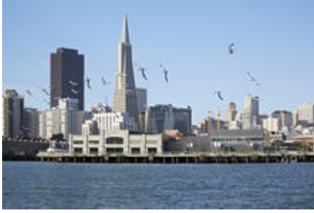
Exploratorium from San Francisco Bay