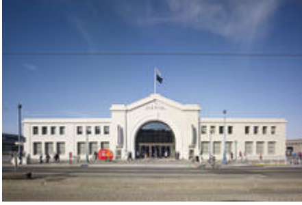
Historic bulkhead from the Embarcadero