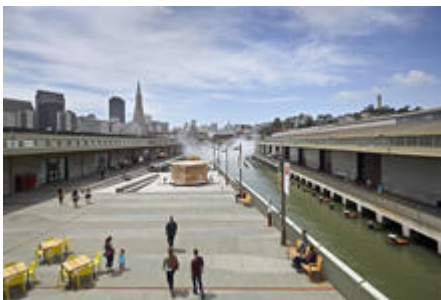
Plaza between Pier 15 and Pier 17

The building hovers above San Francisco Bay and through building and exhibit design makes visitors aware of the local natural environment. An oculus tracks the sun's seasonal journey and illustrates that pattern for visitors to ponder. Exterior metal cladding is perforated with silhouettes of the many species of phytoplankton living in the waters below. The new piers also provide public access around the entire perimeter of the site for enhanced public access to the Bay, to better see and understand the unique ecosystem.