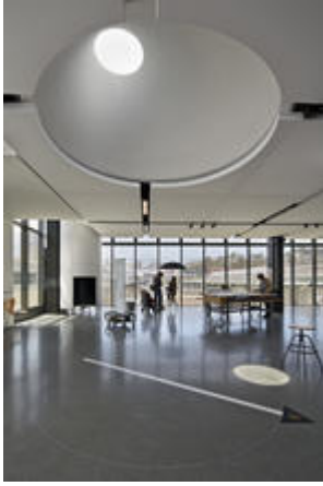
The oculus in the Bay Observatory - Photo Credit: Photo by Bruce Damonte

Given the inherent beauty of the location, the design interventions made to the existing building focused on opportunities to enhance the experience of being on the edge of the Bay. This started in programming, when the design team worked to weave the client's exhibit, education and administrative program requirements into the existing structure without distracting from the character of the historic transit shed or the views. The team balanced the desire for daylight and views with the museum's need to control daylight in exhibit spaces. Administrative and education areas are located to benefit from the existing clerestory windows and skylights enhance those spaces without access to windows. A low-ambient task oriented lighting approach utilizes induction lamp technology to provide minimum ambient levels for interior and exterior lighting while low wattage metal halide and LED lamp sources are used for exhibit and task lighting.