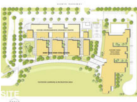
This drawing of the site plan shows the future home of surrounding buildings. - Photo Credit: Studio E Architects