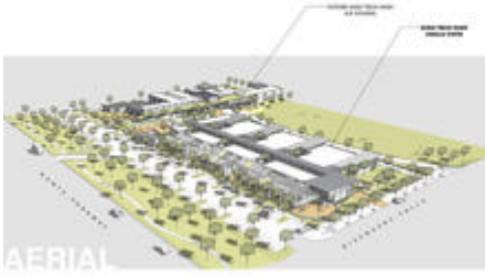
This computer rendering shows an aerial view of the site plan.

The school serves a regional population and does not offer busing. To reduce the number of cars driving through the community to the school and the number of cars needing to park on the site, the school chose a site near mass transit nodes and established a comprehensive Transportation Demand Management (TDM) Program. The program works on both the supply-side and the demand-side of the parking equation. The program includes: