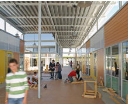
Exterior spaces adjacent to classrooms are used as workshop spaces in the project-based learning environment shown in the photo.