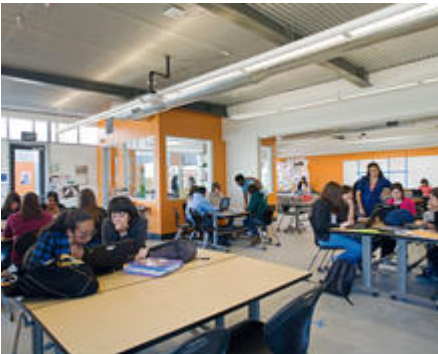
This photo shows students working in small groups in a typical paired classroom with the movable wall open. The teacher offices penetrate into the space to facilitate constant access between the students and faculty.