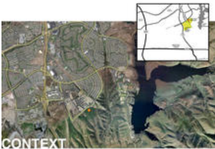
This satellite photo paired with a map show the context of the building site. - Photo Credit: Studio E Architects