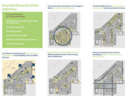
A flexible, orthogonal grid

The campus is organized on a flexible and expandable grid system to organize land uses and infrastructure. Blocks vary in size with a minimum dimension of 300'. Rights-of-way vary in widths but are scaled to support the circulation and open-space objectives of the plan. Utilities