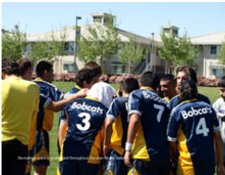
Recreation is embedded throughout