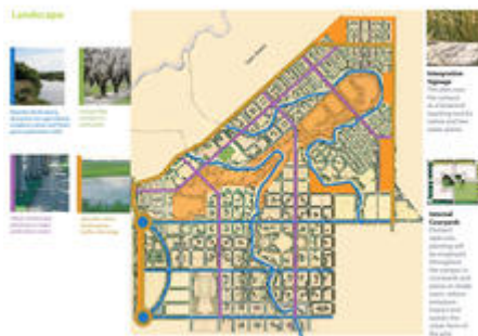
Landscape Plan