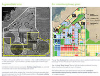
Land Use Plan