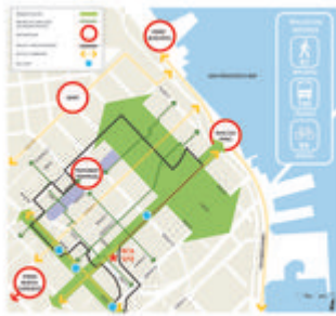
Measure 2 - Second Image - Photo Credit: LMS Architects

The Transbay Redevelopment Project Area was created in 2005 to transform approximately 40 acres south of San Francisco's financial district between the existing Bay Bridge urban freeway and the new Transbay Terminal. A new Transbay terminal will replace the existing terminal and access ramps with a regional transit hub for buses and trains. The project area concept plan includes high-density, transit-oriented market rate and affordable residential and retail development along Folsom Street and office/hotel development surrounding the new terminal.