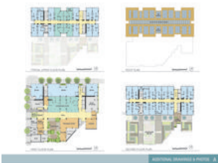
Additional Images - First Image - Photo Credit: LMS Architects