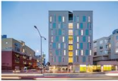
General Description - First Image - Photo Credit: Tim Griffith