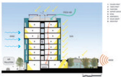
Measure 4 - Second Image - Photo Credit: LMS Architects

The San Francisco microclimate at the Transbay project site is moderate, sunny, and relatively fog free. Prevailing breezes are generally from the northwest. Solar exposure is good due to the limited height of structures to the south of the site. At the same time, its proximity to Bay Bridge freeway off-ramps contributes to poor particulate air quality up to approximately 30 feet above grade.