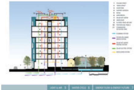
Measure 5 - First Image - Photo Credit: LMS Architects