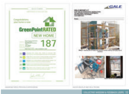
Measure 10 - First Image - Photo Credit: Build-It-Green + Gale Associates

Several strategies were used to model and evaluate the performance of the Rene Cazenave Apartments in addition to the design and construction tracking under the GreenPoint rating system commonly used for residential buildings in the Bay Area.