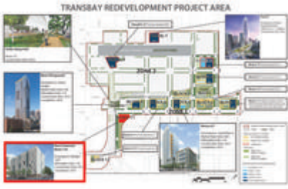
Measure 2 - First Image - Photo Credit: Office of Community Investment and Infrastructure