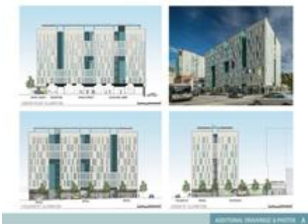
Additional Images - Second Image - Photo Credit: LMS Architects / Tim Griffith