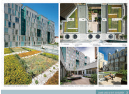
Measure 3 - Second Image - Photo Credit: Patrik Argast + Tim Griffith

Located in a very urban setting near downtown San Francisco, the Transbay redevelopment plan will introduce a new ecology to this former commercial district impacted by freeway off-ramps. New parks, landscaped plazas, and green roofs will transform the area. Surrounding the RCA site, a new under-ramp park will provide recreational and landscape features.