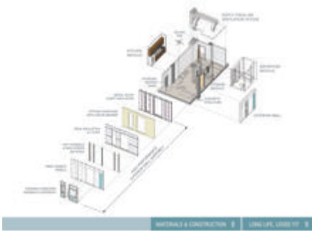
Measure 9 - First Image - Photo Credit: LMS Architects

As permanent support housing for a vulnerable population, Rene Cazenave Apartments were designed for a long life span. Durability and ease of maintenance are top priorities for the non-profit owner with a limited operations budget.