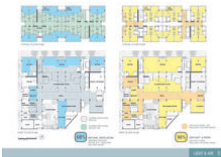
Measure 5 - Second Image

Comfortable and healthy living spaces are a key component of residences for formerly chronically homeless individuals who typically have physical disabilities.