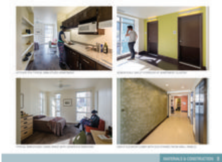
Measure 8 - Second Image - Photo Credit: Tim Griffith

The criteria for material selection for Rene Cazenave Apartments was based on the special needs of the residents and the non-profit owner/operator who has extensive experience with supportive housing. Healthy properties, high durability, ease of maintenance and energy efficiency were all critical aspects for materials. The non-profit owner will be operating the building for decades to come within a limited operating budget.