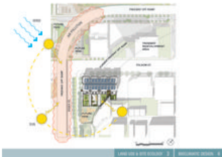
Measure 3 - First Image - Photo Credit: LMS Architects