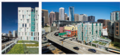
General Description - Second Image - Photo Credit: Tim Griffith

As the first new building constructed in San Francisco's transformative Transbay Redevelopment Area, Rene Cazenave Apartments (RCA) sets a high standard for future development by replacing a parking lot and former freeway off-ramp with innovative and neighborhood supporting housing and supportive services as a permanent home for formerly chronically homeless residents, many who have physical and mental disabilities.